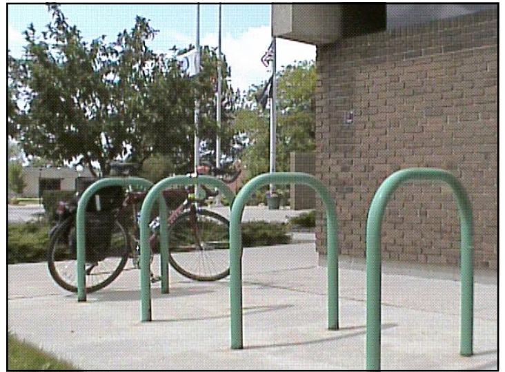
New bicycle racks at Vandalia City Hall